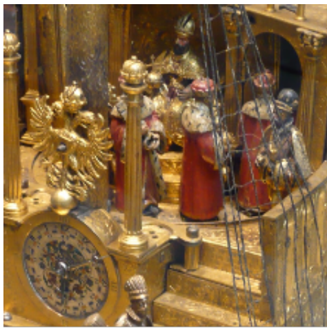
Detail from the mechanical clock