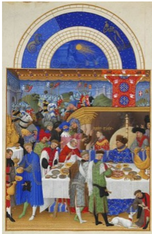
Page from the calendar of the Très Riches Heures showing the household of John, Duke of Berry exchanging New Year gifts. The Duke is seated at the right, in blue.

These nefs were usually made of silver, silver-gilt or occasionally gold, often further embellished with enamel and jewels. A nautilus shell occasionally formed the hull of the ship, as with the Burghley Nef. Some even had wheels to allow them to be rolled from one end of the table to the other, but most had legs or pedestals. The nef was placed in front of the most important person at table as a mark of their status.