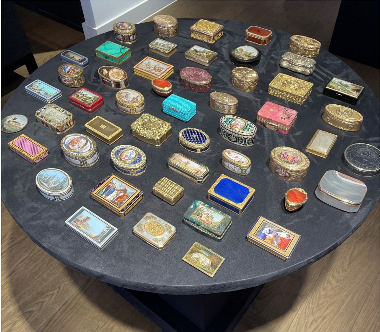
Directors Choice – A Plethora of Temptations for a House of Treasure