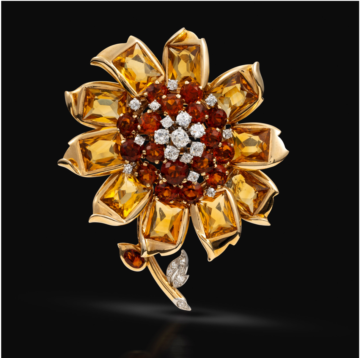
Directors Choice - The Brooch is Back!