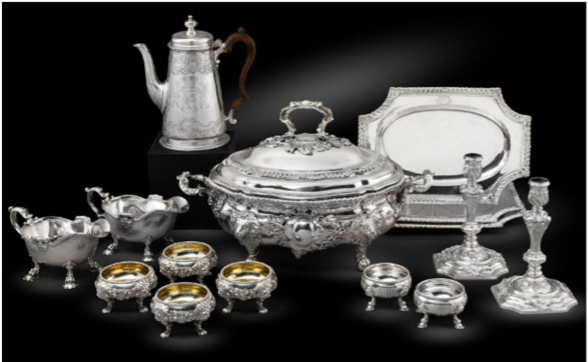
Director's Choice – Paul de Lamerie