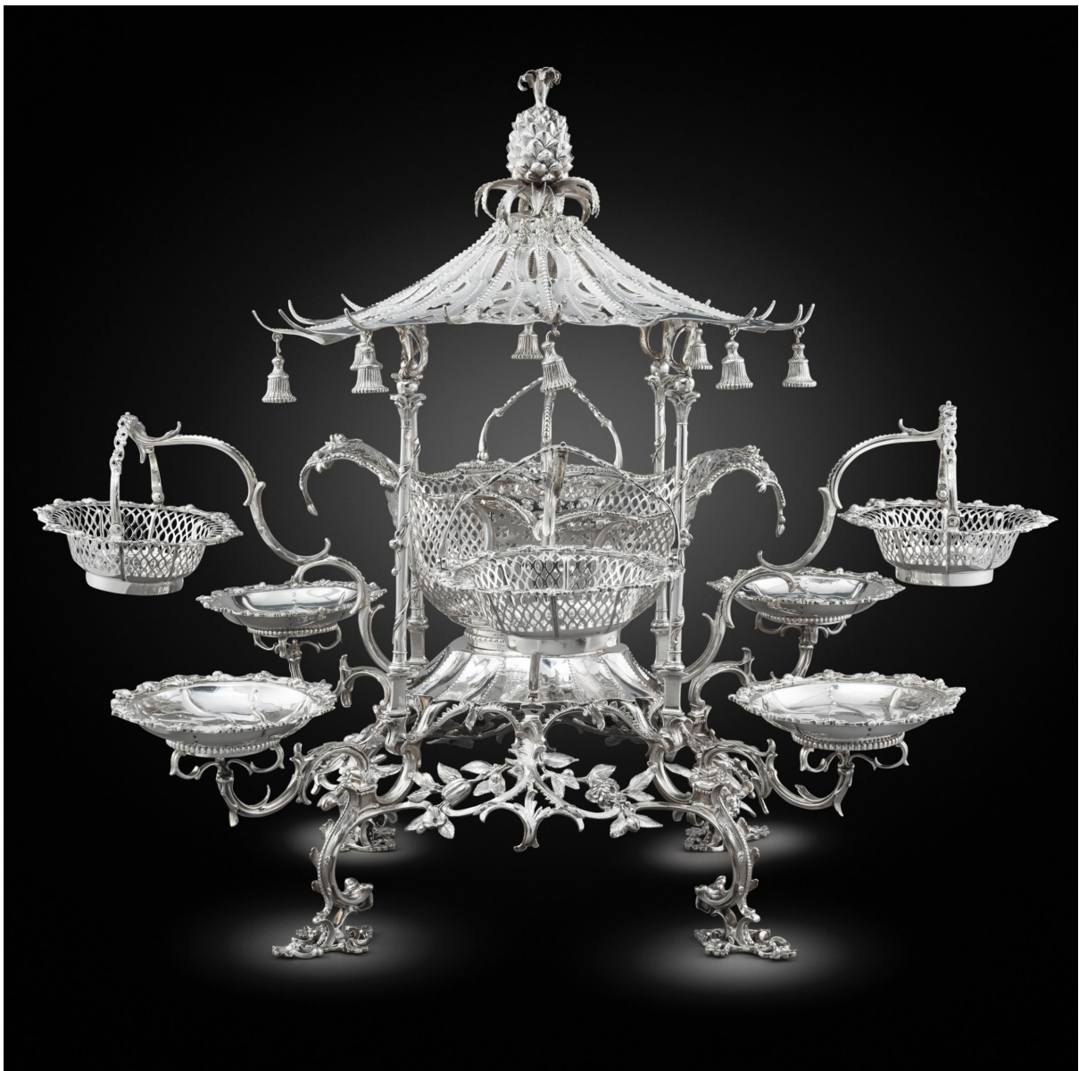
Directors Choice – A George III Pagoda-Form Epergne