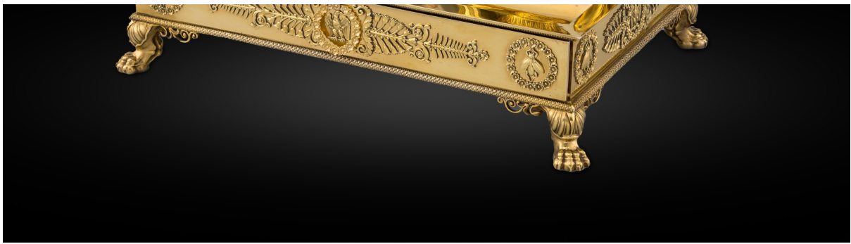
Directors Choice – The Madame Mere Inkstand